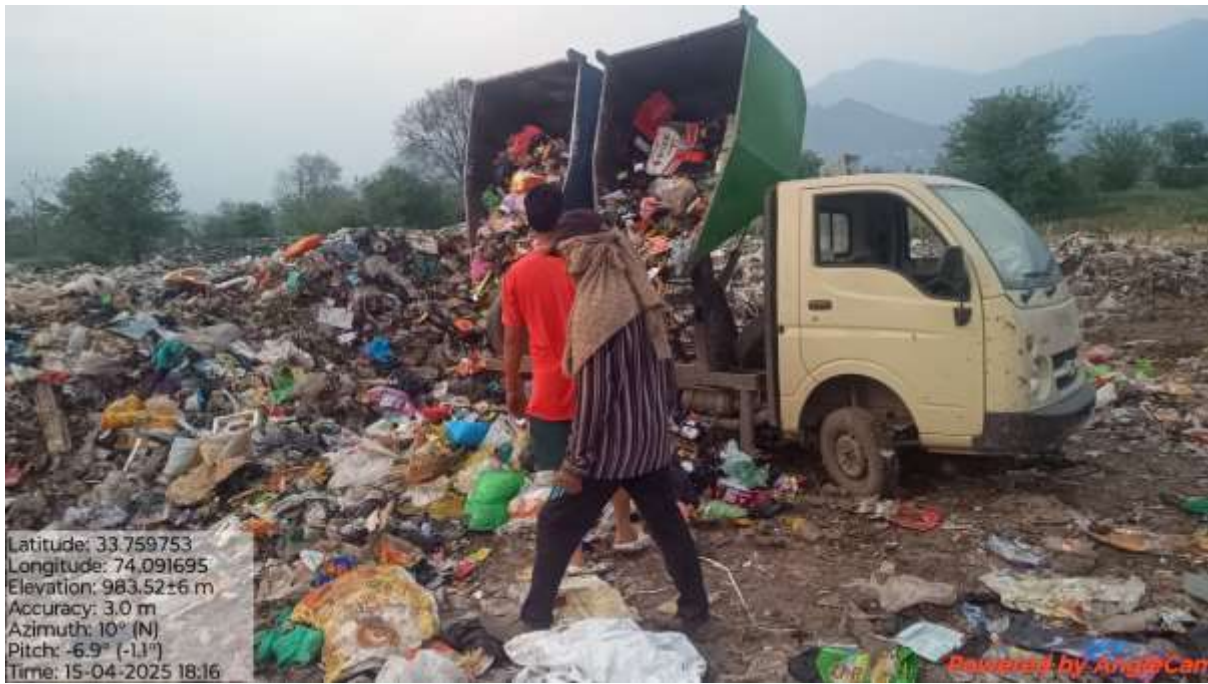
Photograph showing fresh dumping of waste on 15.04.2025