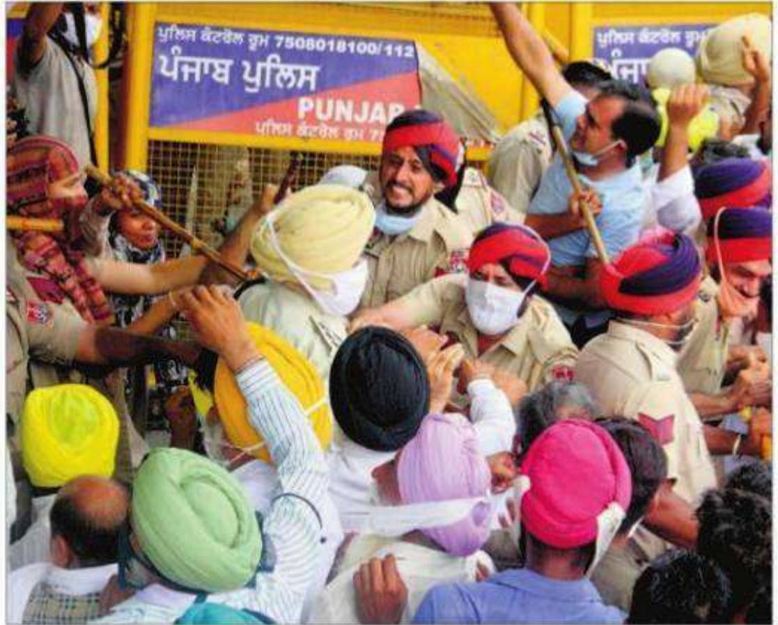
Protesting Aam Aadmi Party activists clash with cops in Bathinda on Wednesday.

Subsequently, another Cabinet sub-committee was set up on May 18 to work out the modalities for redeveloping